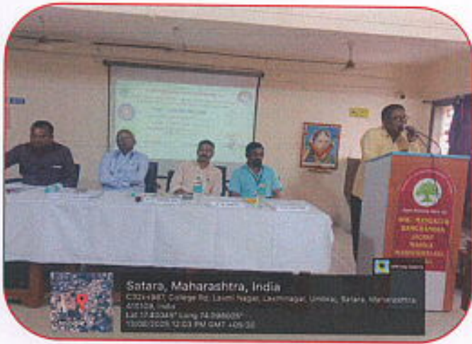
Setara, Maharashtra, India CID: 1987, College Rd, Lavni Nagar, Lakhnagar, Umbraj, Setara, Maharashtra, 418123, India Lat: 17.423347° Long: 74.096005° 13/08/2025 12:53 PM GMT +05:30