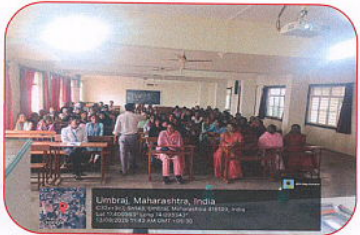
Umbraj, Maharashtra, India CID: 1905, SNAAS, SNAAS, Maharashtra 418123, India Lat: 17.409963° Long: 74.095147° 13/08/2025 11:42 AM GMT +05:30