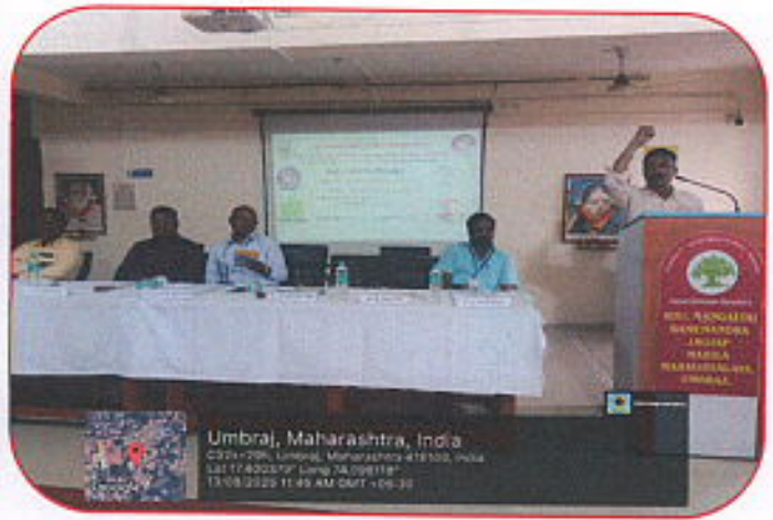
Umbraj, Maharashtra, India CID: 1798, Umbraj, Maharashtra 418103, India Lat: 17.402379° Long: 74.098118° 13/08/2025 11:49 AM GMT +05:30