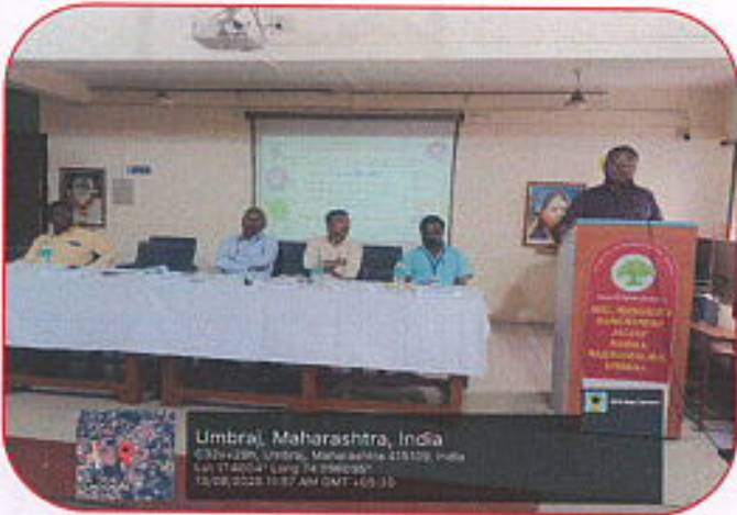
Umbraj, Maharashtra, India CID: 1798, Umbraj, Maharashtra 418103, India Lat: 17.402379° Long: 74.098118° 13/08/2025 11:57 AM GMT +05:30